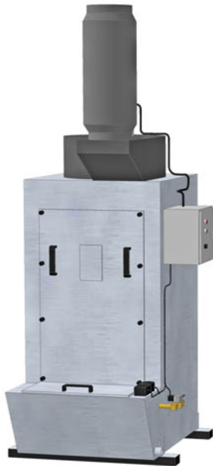
Stainless Steel Wet Dust Collector